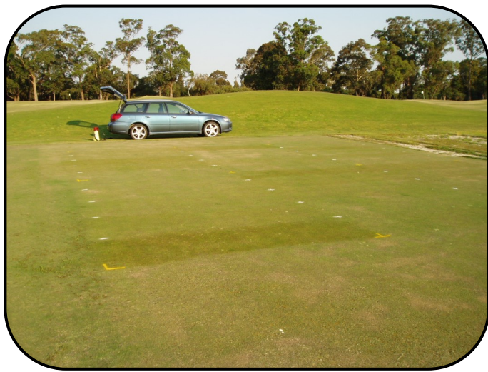
The trial site is shown above after the application on February 12 th 2008